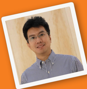
YAM Tunku Zain Al- 'Abidin ibni Tuanku Muhriz

Founding president and chairman of IDEAS Tunku Zain Al- 'Abidin is the president of the Institute for Democracy and Economics of Affairs